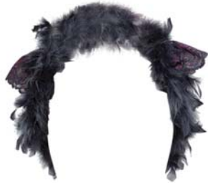
A770F (Bed Jacket)